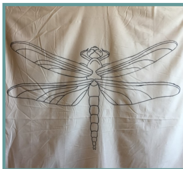
On the right, Meganeura (a prehistoric insect with a wingspan of about thirty inches, similar to today's dragonfly).