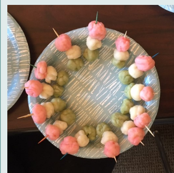
Dango Dumplings, a Japanese delicacy, prepared by Myka, an ELO Hub student studying the Japanese Culture.