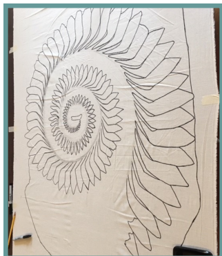
The bottom jaw of the Helicoprion (a prehistoric shark whose bottom jaw consisted of a spiral of teeth about three feet wide).